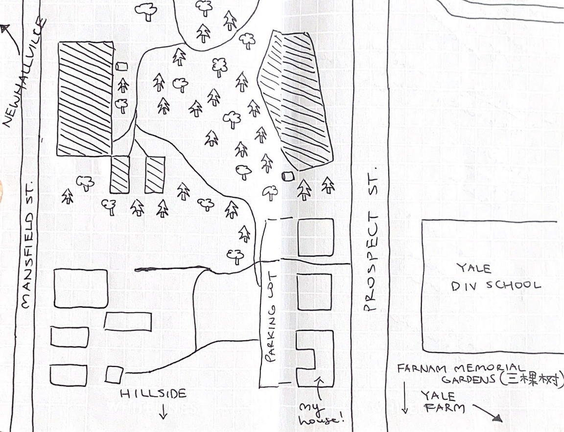
Map of the Garden and surrounding areas; Garden areas are shaded with diagonal lines.