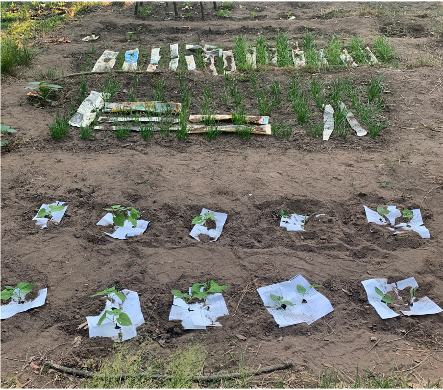
(above) Yang Shengming's scrap paper mulch; (right) Liu Mei's bottle fly trap